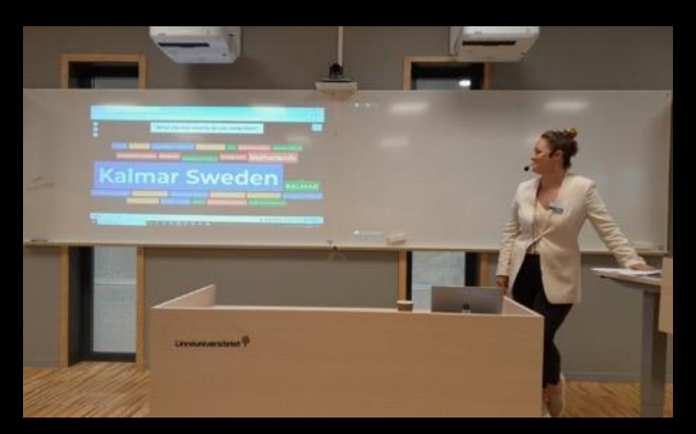
LIFE SURE Conference connecting researchers, stakeholders and entrepreneurs.