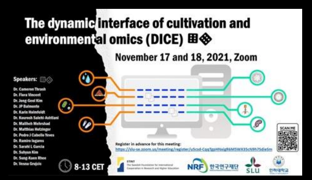
An array of virtual events (such as the DICE workshop) during times of travel restrictions