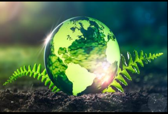
2022 Launch of SciLifeLab funded national capability in "Planetary Biology". Kickoff conference with similar initiative at EMBL to discuss future collaboration. "Life in environmental context" with emphasis on biodiversity, ecology & microbes