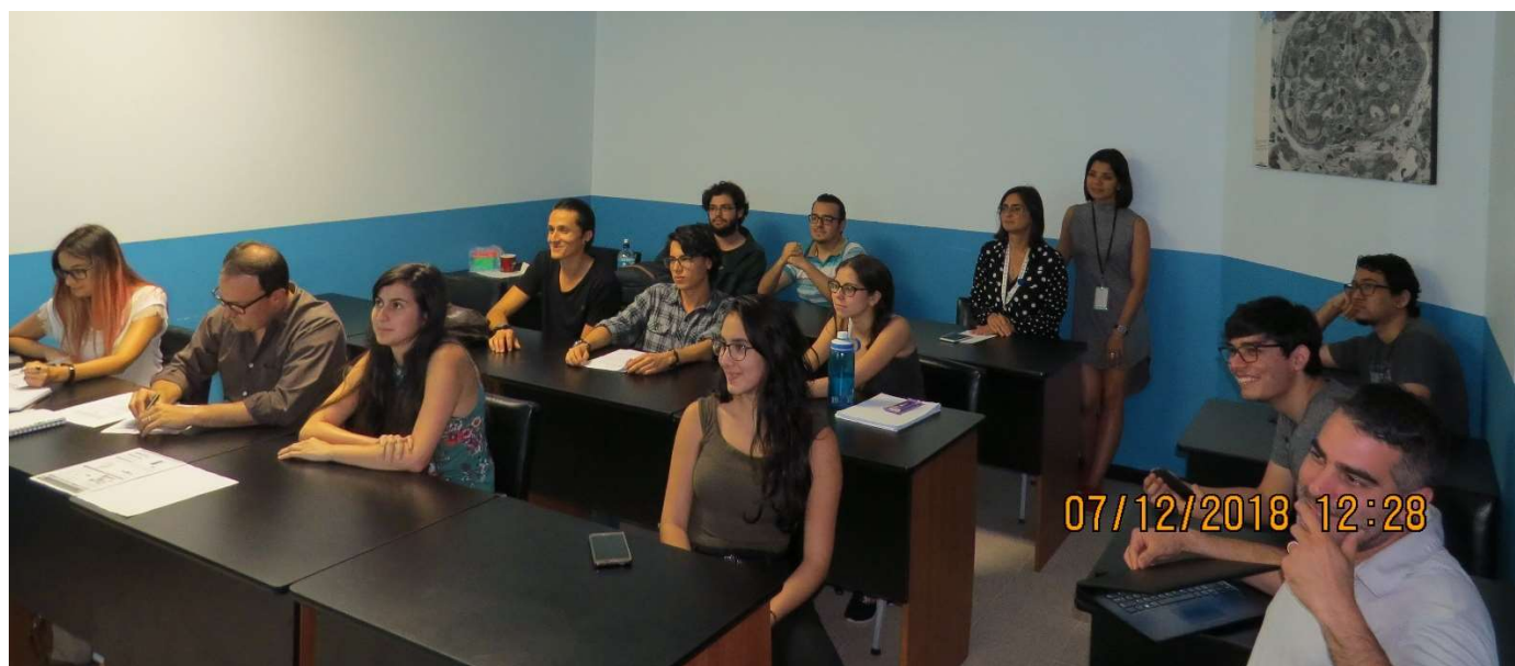
Figure 3. Costa Rican Scientists attending the poster competition